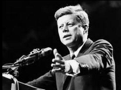
John F. Kennedy