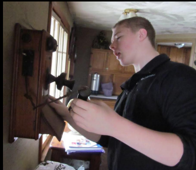
Making gifts and cards for the holidays!