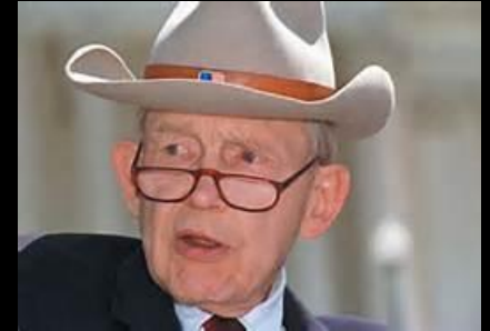
Justin Dart, Jr.