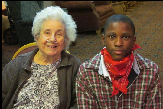
Spending time at a Nursing Home for Halloween!